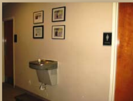
Men's & Women's Restroom