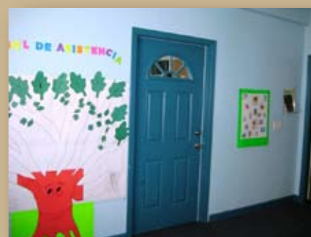
2 Children's Playrooms