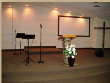
Stage with Spotlights