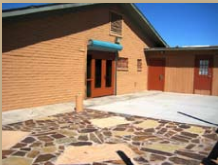
Large, Gated Yard