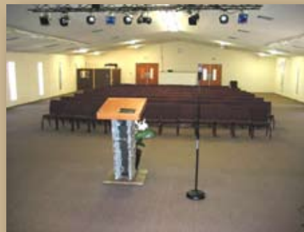
Spacious Sanctuary Including a Soundbooth