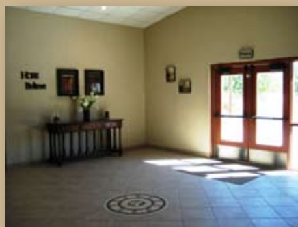
Welcoming Vestibule With Beautiful Tiling