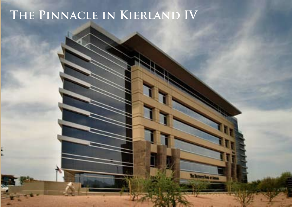
THE PINNACLE IN KIERLAND IV