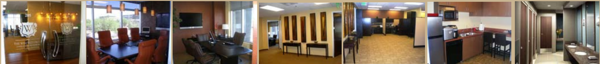
COMMON AREA INCLUDES RECEPTION AREA, BREAK ROOM, ACCESS TO COPY/SCANNER/FAX/POSTAGE ROOM, CONFERENCE ROOM WITH 63" PLASMA TV

FOR MORE INFORMATION OR TO SCHEDULE A SHOWING, PLEASE CONTACT: