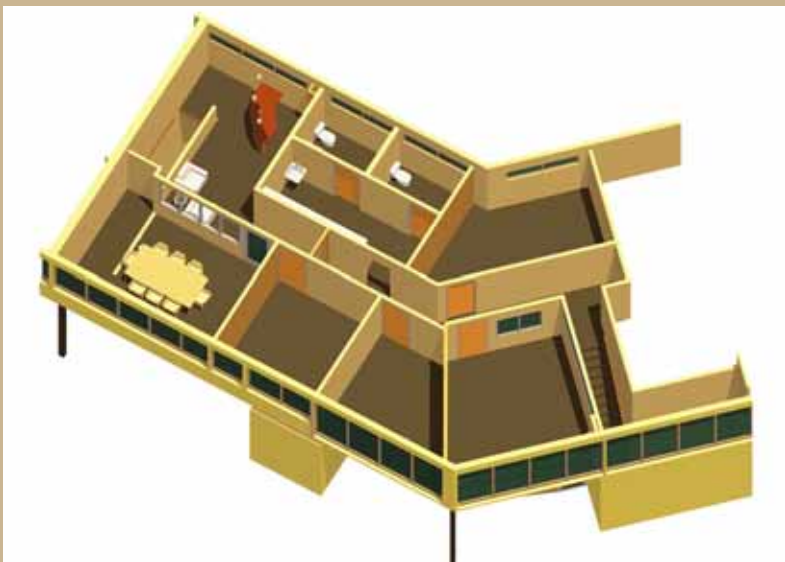
4 Private Offices