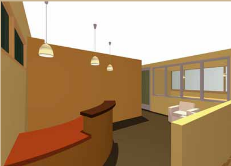
Welcoming Reception Area