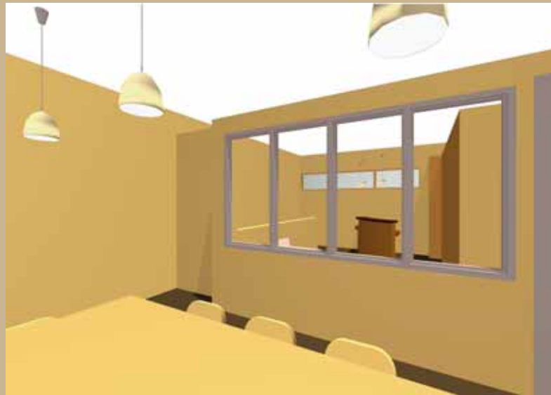
Spacious Glass Conference Room