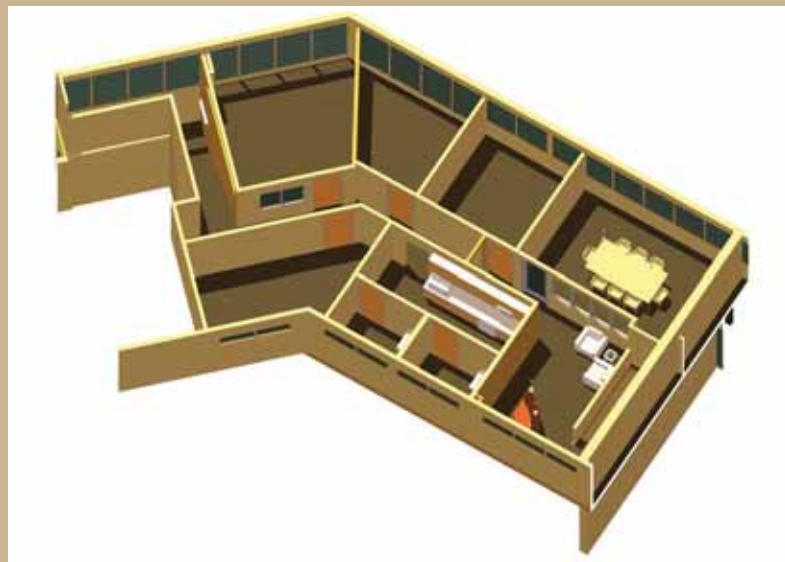
Kitchen/Break Area, Copy Fax & Interior Suite Restrooms

CLASS "A" INTERIOR FINISHES AND ONE OF SCOTTSDALE'S MOST PROMINENT CORNERS